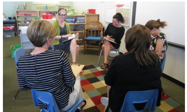
Teachers participate in a Touchpebbles training as they learn to maximize the opportunities presented by the discussion circles.