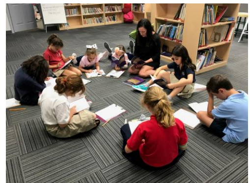
After reading the writings of various authors from Aesop to Francis Bacon to Malcolm X, students hold an open-ended discussion around morals and values.